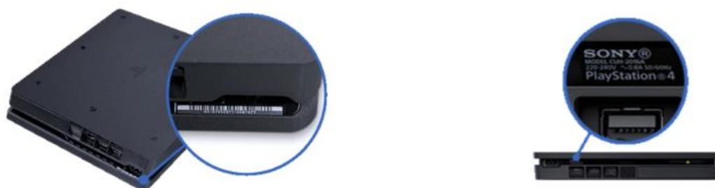
PS4 console Slim image

The model number is located on the back of the system to the right of the power port.