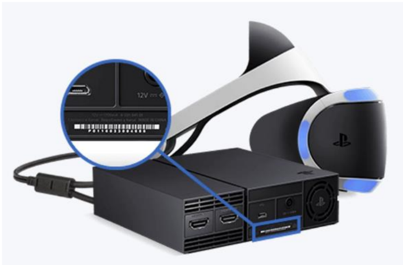
PlayStation VR image