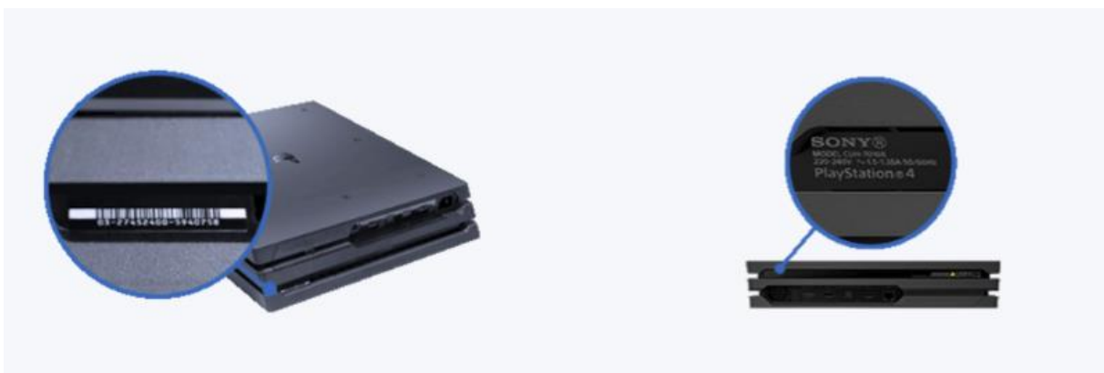
PS4 console Pro image

The model number is located on the back of the system, above the system port.