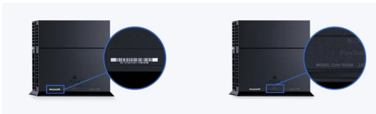
PS4 console (basic) image

The model number is located on the back of the system, in the lower left corner of the chassis.