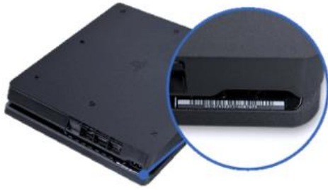
PS4 console Slim image