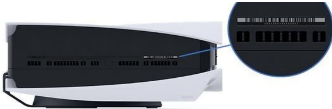
PS5 console image (Slim, Disc and Digital)