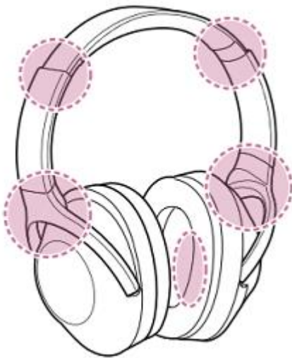
PlayStation headset Pulse 3D image

Note! Always use the serial number of the headset itself. Serial numbers of included accessories are different.