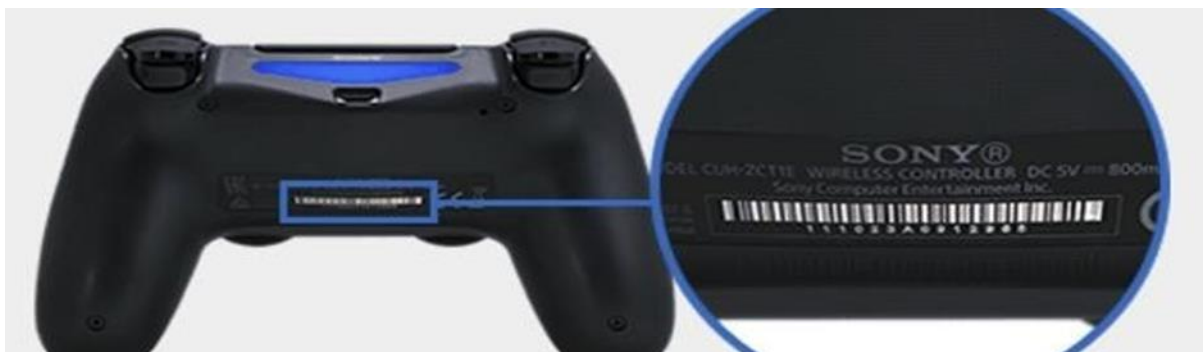
PS4 controller image

The serial number is located on the back of the wireless controller, as a barcode and in writing below the barcode.