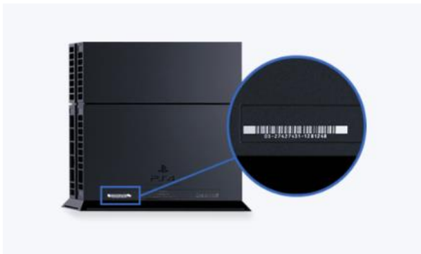
PS4 console (basic) image

The serial number is located on the back of the system, in the lower left corner of the chassis.