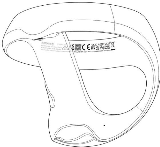
PlayStation VR2 controller image

The serial number is located on the inside of the tracking ring, as a QR code and in writing below the QR code.