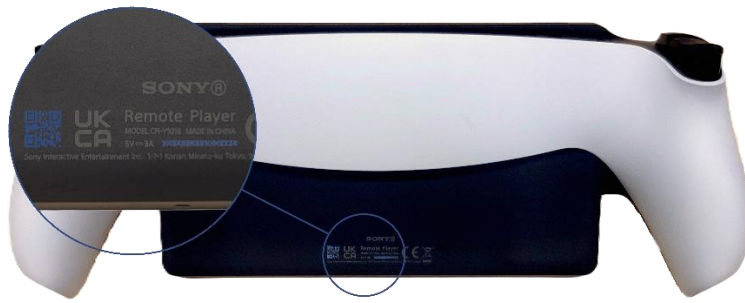
PlayStation Portal image