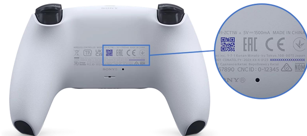
PS5 controller image

The serial number is located on the back of the controller, as a QR code and in writing below the QR code.