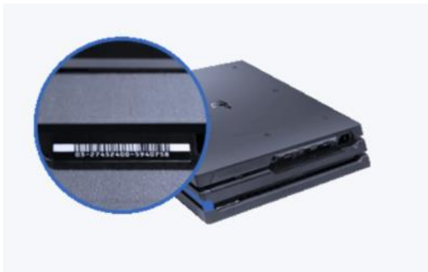
PS4 console Pro image

The serial number is located under the bezel, opposite the system ports. You need to turn the system over to see this number.