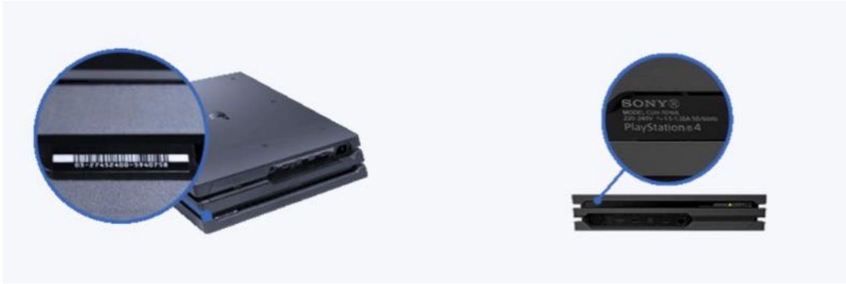
PS4 console Pro image