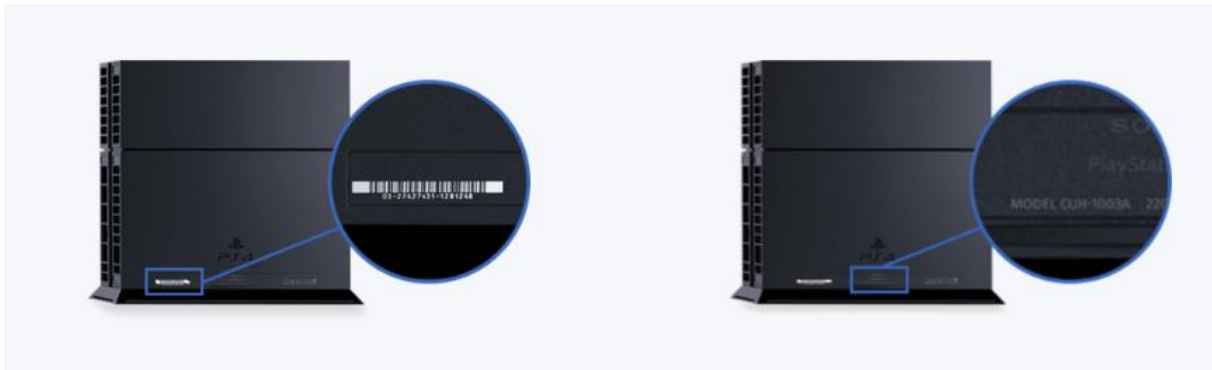
PS4 console (basic) image