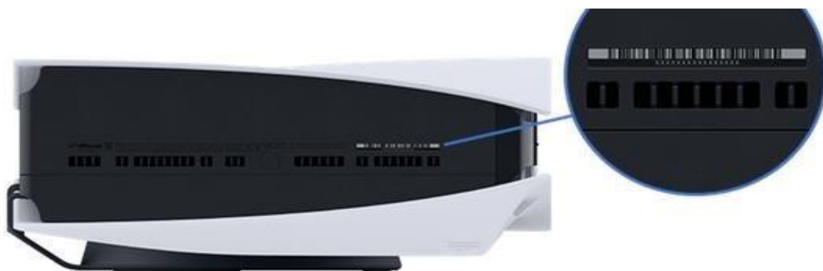
PS5 console image (Slim, Disc and Digital)

The model number is located on the bottom of the console when it is placed vertically. Remove the base to reveal the serial number and model number of your PS5.