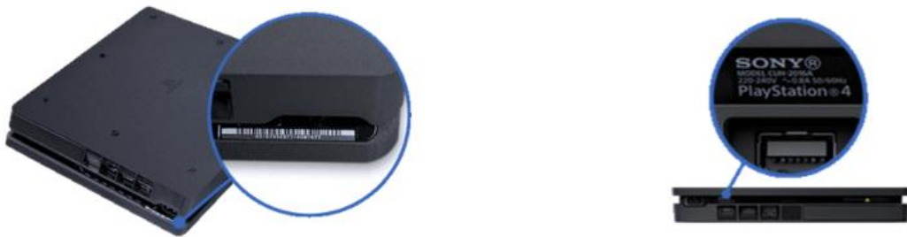
PS4 console Slim image

The model number is located on the back of the system to the right of the power port.